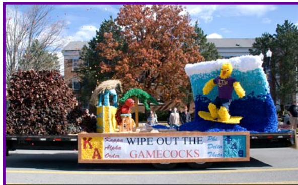
3rd Place Winner—Kappa Alpha & Phi Delta Theta