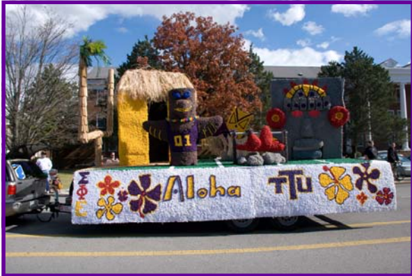
2nd Place Winner— Sigma Phi Epsilon

Third Place: Kappa Alpha Order & Phi Delta Theta