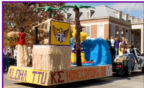
Alpha Delta Pi & Kappa Sigma