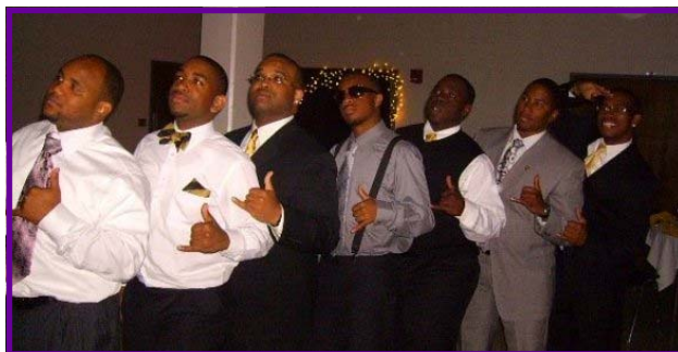
TTU's Alpha Phi Alpha chapter

On Friday, November 7, the TTU National Pan-Hellenic Council held their 3rd Annual Step Show competition in Derryberry Hall Auditorium. This year's theme, which mirrored the overall Homecoming theme, was "Divine Steps to Paradise."