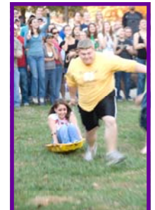
Hawaiian Olympics competition in the Main Quad. Pictured 1) Limbo and 2) Boogie Board Relay