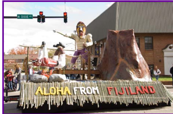
1st Place Winner— FIJI & Kappa Delta