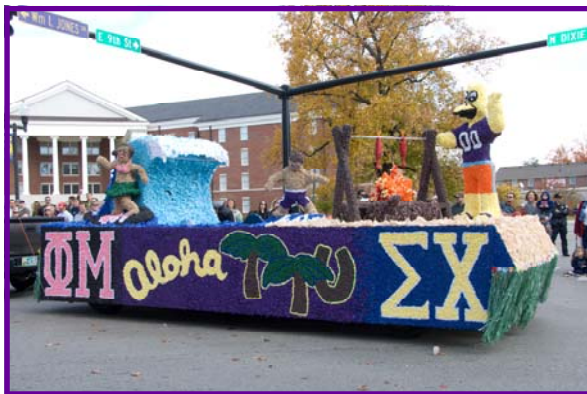
Phi Mu & Sigma Chi