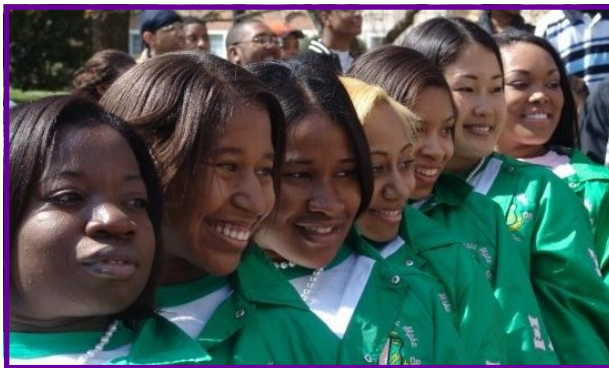
TTU's Alpha Kappa Alpha chapter