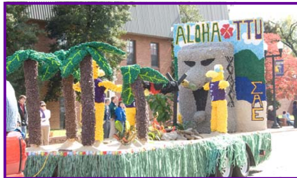
Delta Gamma & Sigma Alpha Epsilon