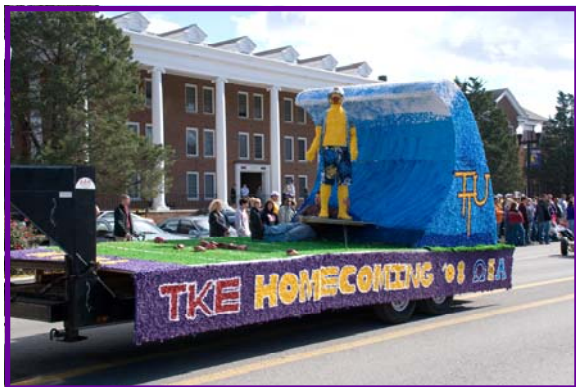
Tau Kappa Epsilon & Omega Phi Alpha