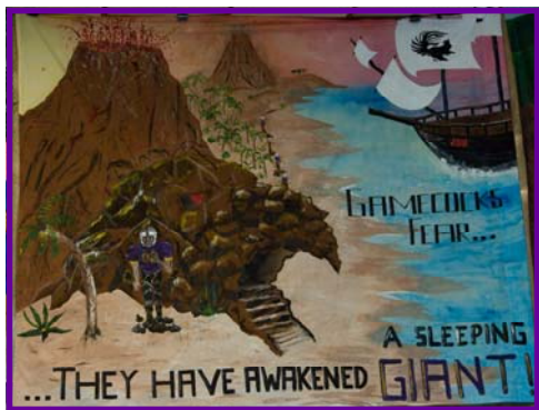
UCSC's 1st Place Banner hanging in the UC