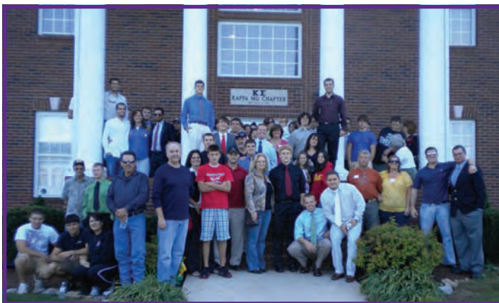
Kappa Sigma Family Day Photo