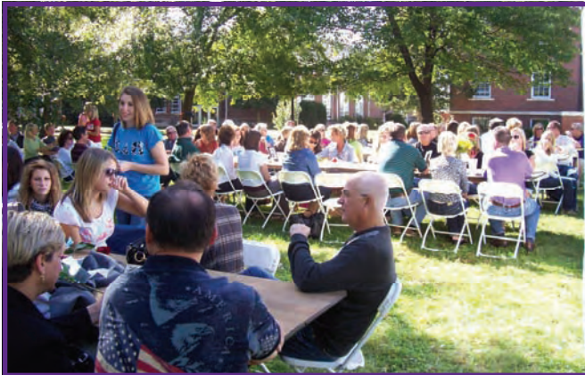
Alpha Delta Pi's Family Day Celebration in the Main Quad