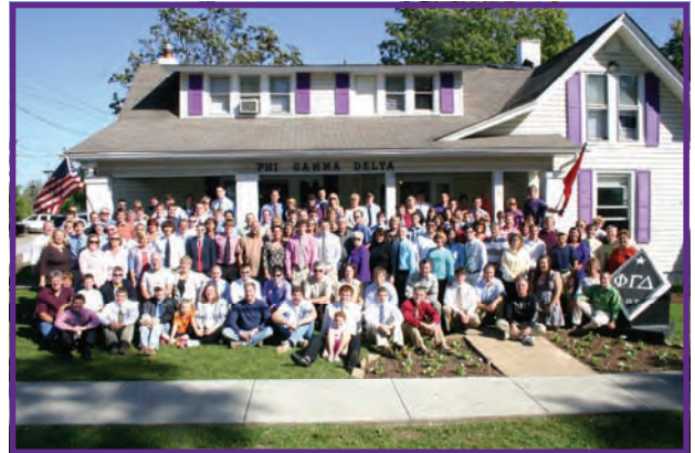
Phi Gamma Delta Family Day