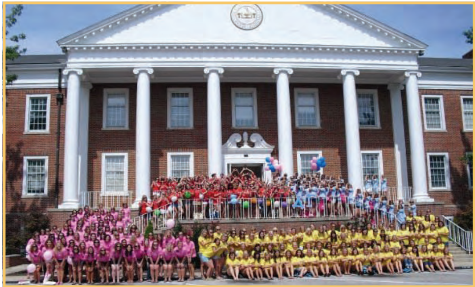
Bid Day Photo 2009