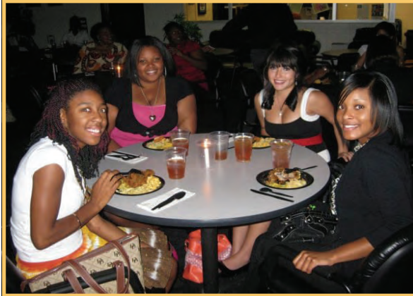
AΦA Ladies Appreciation Dinner