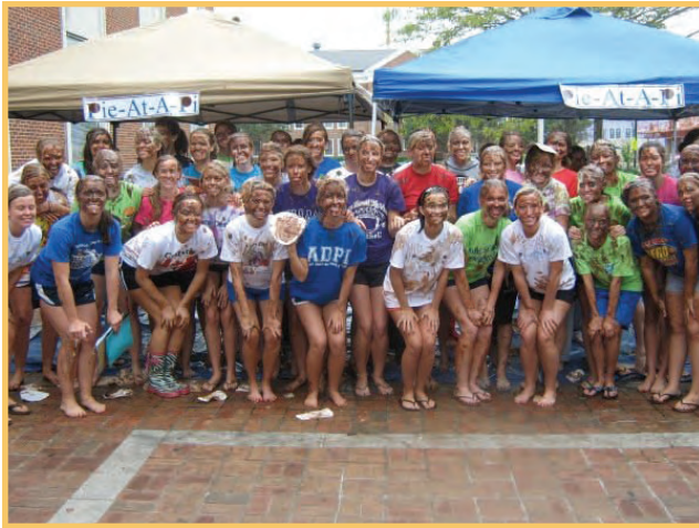
Pie at a Pi