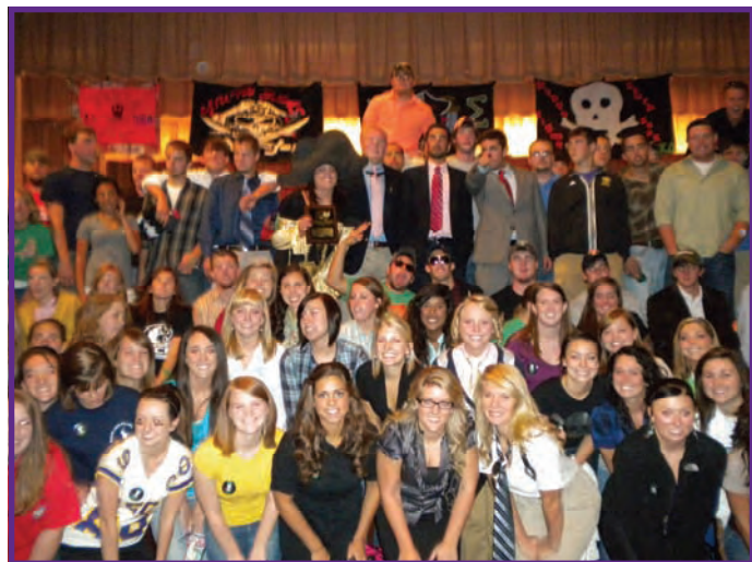
Kappa Sigma's South Seas Pageant

For more information about the Fischer House, visit www.fallenheroesfund.org