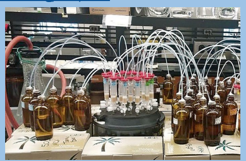
Left: The lab Tammy Boles and her team used to monitor opioids in wastewater

Check out the article at: <u>https://cen.acs.org/</u> environment/water/opioids-down-drain-scientiststracking/97/i16