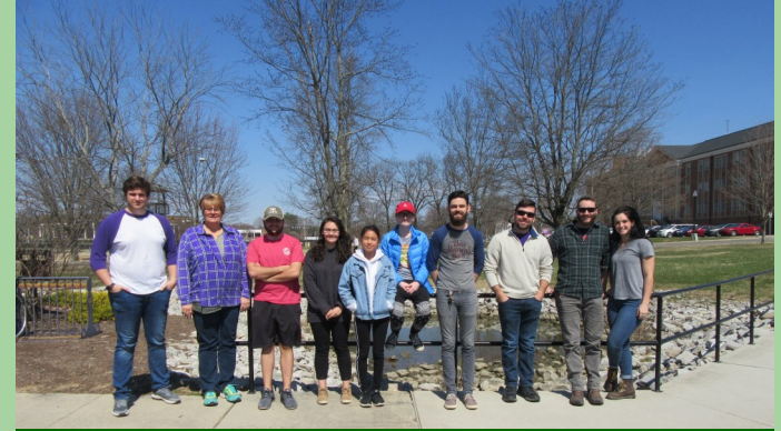
Spring 2019 Capstone Group Photo

The capstone group offered recommendations based on successful practices for prevention of illegal dumping, including onsite practices at existing sites, such as posting