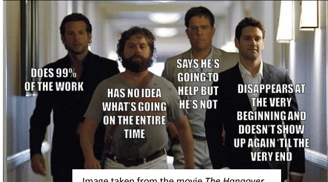
Image taken from the movie The Hangover