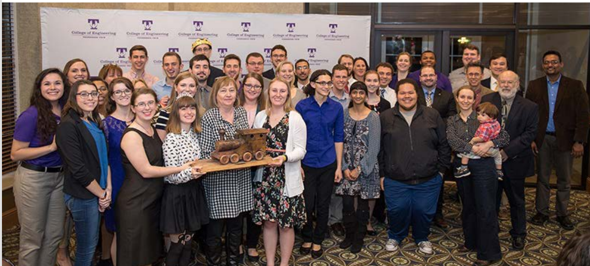
Engineers Week (EWeek) Awards Banquet