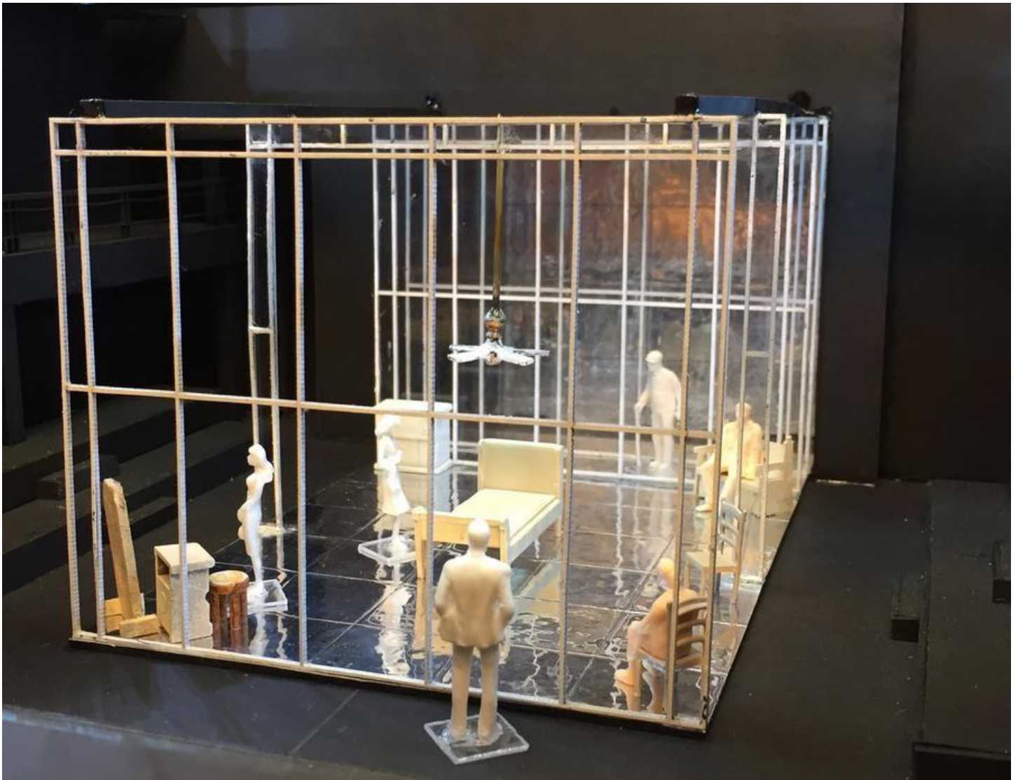
Note the high quality of the scale models