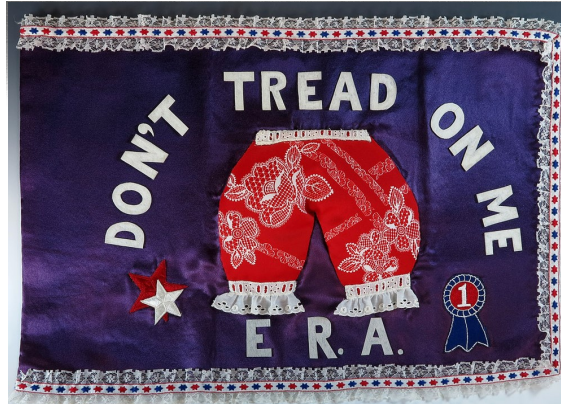
Betty Ford's Limousine Flag

The addition of the ERA to the constitution would help clarify the laws on sex discrimination for court cases.