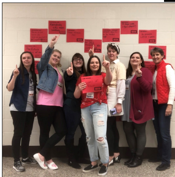
Women's Center volunteers at One Billion Rising, an annual event centered around the global movement against interpersonal violence.