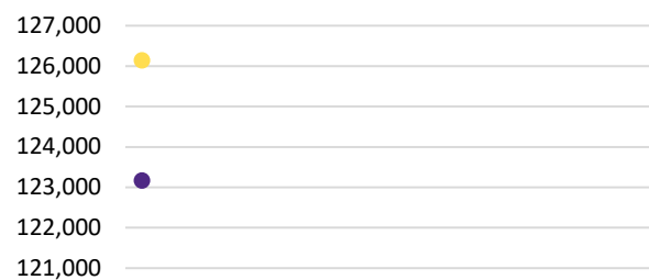
Student Credit Hours