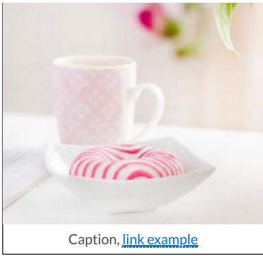
Caption, link example

caption, which describes the important content displayed in the image.