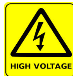
High Voltage Equipment